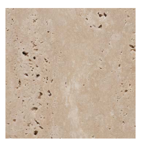
Beige roman travertine unfilled