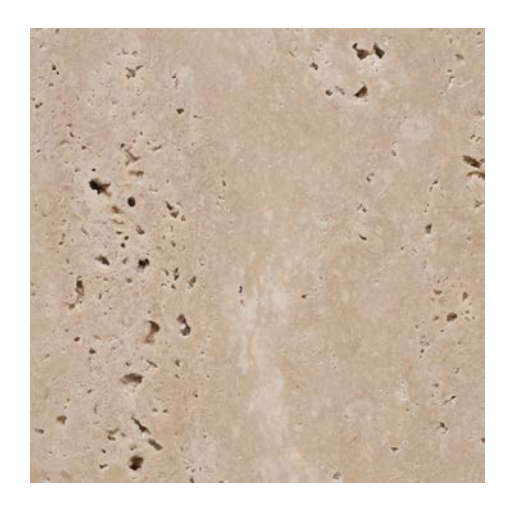
Beige roman travertine unfilled