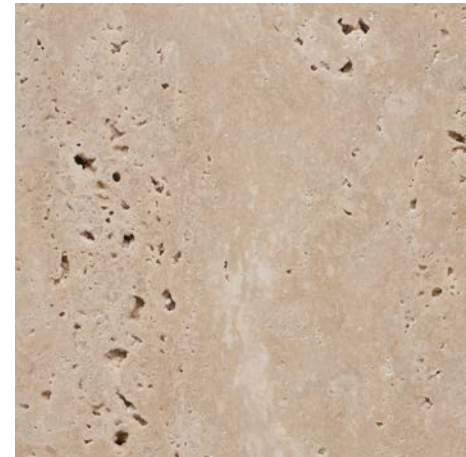
Beige roman travertine unfilled