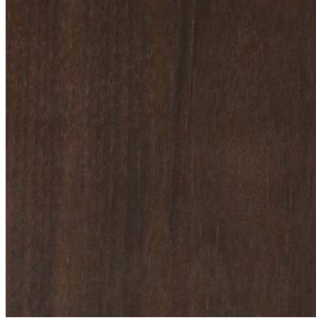
NY.202.010 smooth walnut / matt

As wood is a natural material, variations in tint may occur