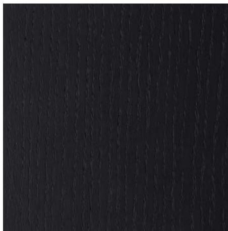
CH.097.005 smooth oak / matt

As wood is a natural material, variations in tint may occur