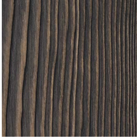
EP.045.005.B brushed spruce / matt

As wood is a natural material, variations in tint may occur