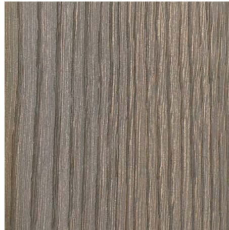
CH.205.005.B brushed oak / matt