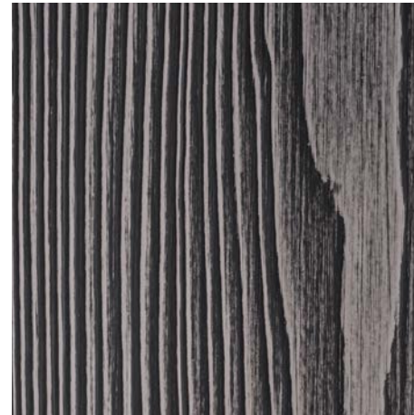
EP.698.005.B brushed spruce / matt