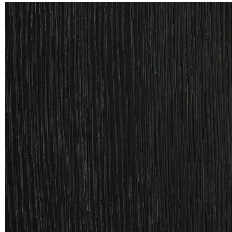
CH.853.005.B brushed oak / matt