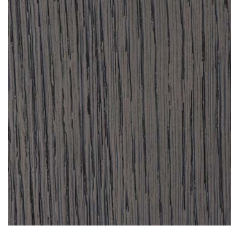
CH.071.005.B brushed oak / matt