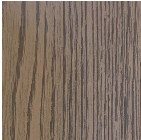
CH.101.005.B brushed oak / matt