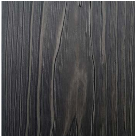
EP.565.005.B brushed spruce / matt