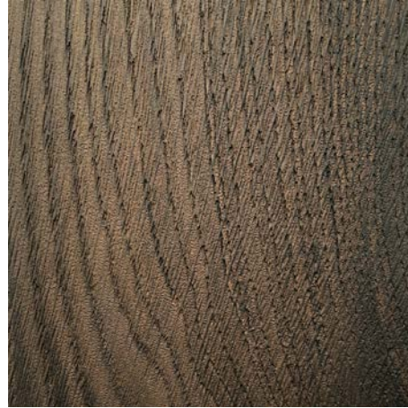
CH.762.005.B smoked brushed oak / matt