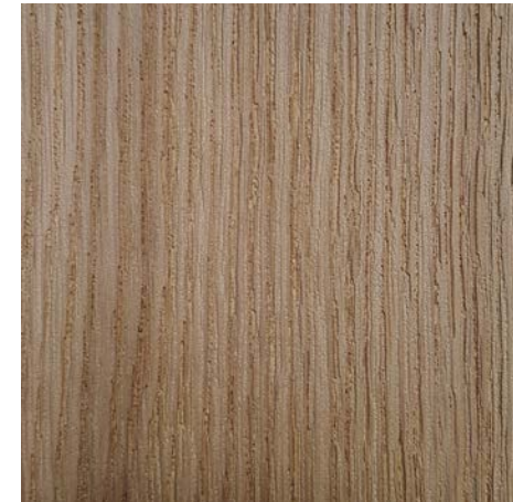
CH.044.005.B brushed oak / matt