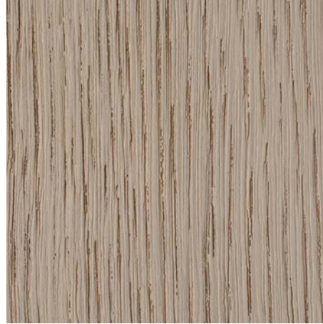
CH.032.005.B brushed oak / matt