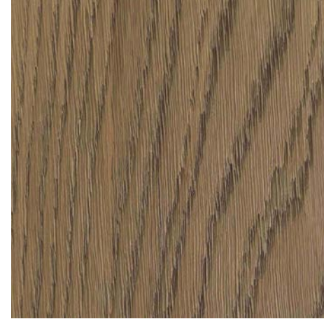
CH.841.005.B brushed oak / matt