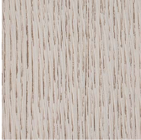
CH.099.005.B brushed oak / matt

As wood is a natural material, variations in tint may occur