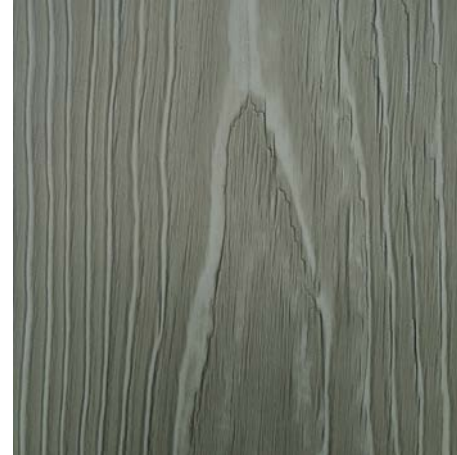
EP.555.005.B brushed spruce / matt