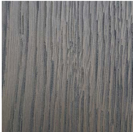
CH.177.005.B brushed oak / matt