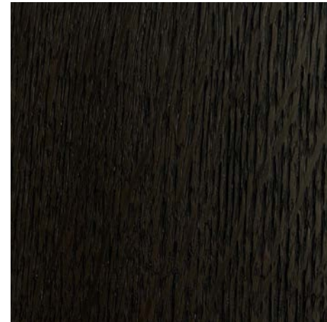
CH.892.005.B brushed oak / matt