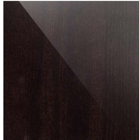
NY.053.100 smooth walnut / High-gloss