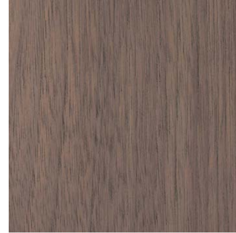
NY.281.005 smooth walnut / matt