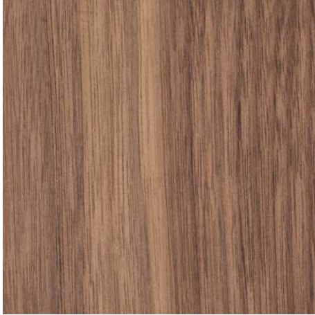
NY.046.005 smooth walnut / matt

As wood is a natural material, variations in tint may occur