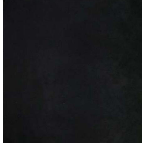
Bronze black patina