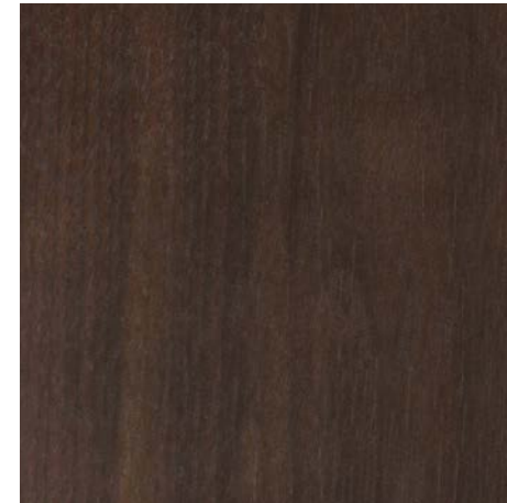
NY.202.010 smooth walnut / matt