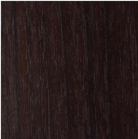
NY.038.015 smooth walnut / satin