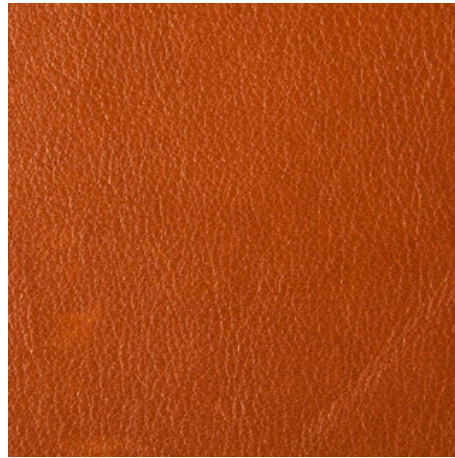
Vegetal 95 - Stolz