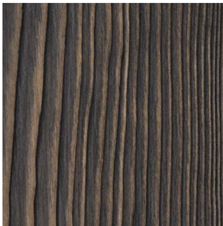
EP.045.005.B brushed spruce / matt

As wood is a natural material, variations in tint may occur