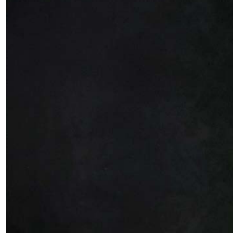
Bronze black patina